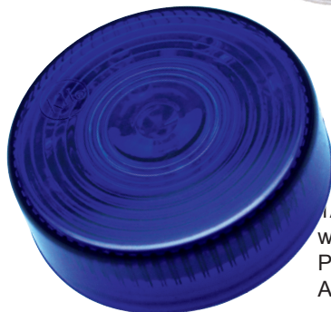
1A-S-56BV with Capacitor for Police Motorcycle Application